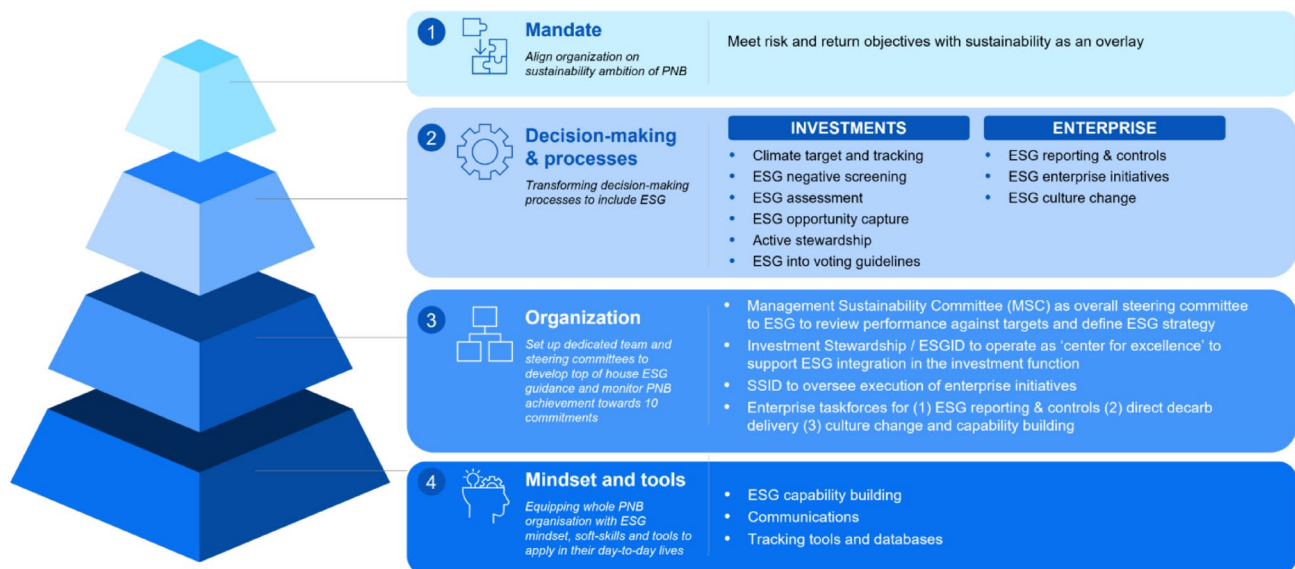
Exhibit 2: PNB's Sustainability Approach

We are embedding ESG considerations into all parts of the organisation (Exhibit 2). Embedding ESG into all processes of decision-making allows us to augment our efforts in identifying opportunities for value creation and managing ESG risks.