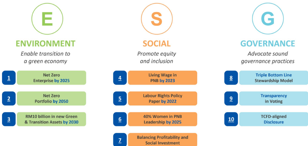
Exhibit 1: PNB's Ten (10) ESG Commitments